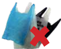
Plastic bags and wrapping