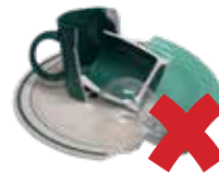
Broken glass and crockery

* Refer to page 15 for more information about the Be Sharp Safe program.