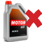
Motor oils and fuels*

* Take these items to the Community Recycling Centre (CRC). Refer to page 12 for more information.