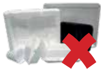
Foam including meat trays