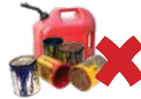
Paint and chemicals*