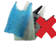
Plastic bags and wrapping