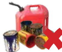
Paint and chemicals**