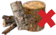
Stumps and logs

PLACE THESE ITEMS IN YOUR GREEN LID GARDEN WASTE BIN: