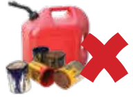
Paint and chemicals**