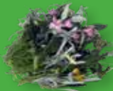
Flowers and pruning