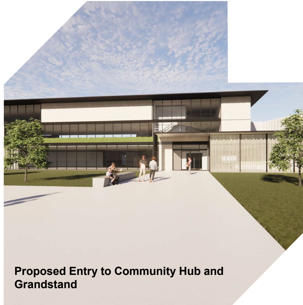
Proposed Entry to Community Hub and Grandstand