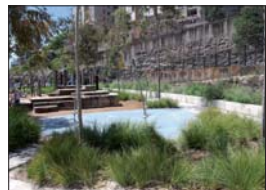
Robust outdoor meeting spaces