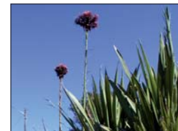
Distinctive native planting around CPAC forecourt