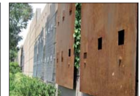
Weather resistant Corten Steel