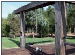
Robust play equipment