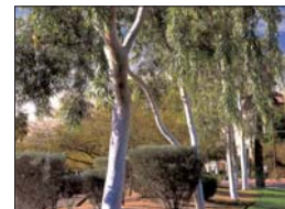
Feature native trees along sculpture walk axis path