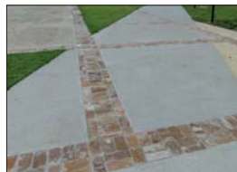
Hard surface materials reflecting post industrial heritage