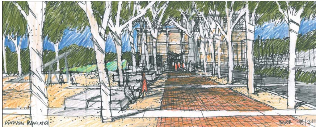
④ View looking south along native tree lined sculpture walk axis path towards the Powerhouse and Entry Forecourt with CPAC event space on the left and the CPAC car park on the right