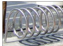
Secure bike parking