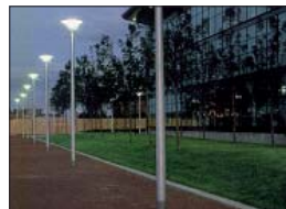
Solar lighting at selected locations