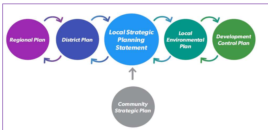
Figure 1 – Planning framework

On 2 February 2022 Council endorsed their 100 Day Plan which included the commitment to prepare a new Liverpool LEP as a matter of urgency, and to lower heights of buildings in a number of suburbs. The Phase #2 LEP Review will be addressing these 100 Day Plan items.