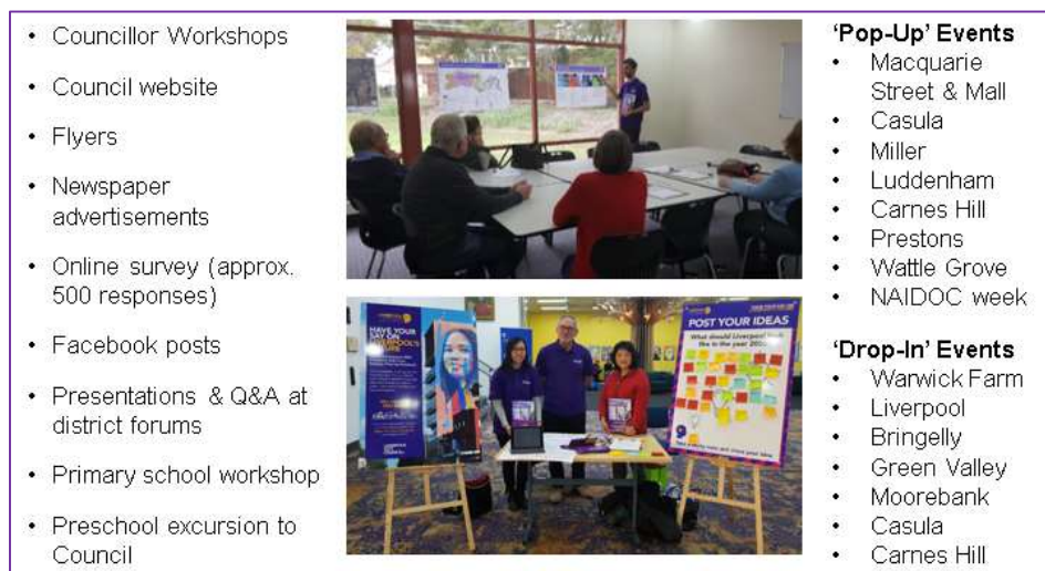
Figure 2: Previous LEP Review Community Engagement

The LSPS, Land Use Strategies and Phase 1 LEP review underwent two rounds of extensive community engagement. This was guided by a Community Engagement Action Plan, with the objective of generating awareness of the project in the wider community and gathering feedback to inform the preparation of the LSPS, strategies and LEP review. This included engagement with young people, culturally diverse communities, key interest groups, Government and Non-Government organisations, the business community and development industries. Various methods of engagement were used to ensure the diverse community of Liverpool LGA had the opportunities to participate (see Figure 2). The first round of engagement resulted in 147 formal submissions, 542 survey responses and over 680 “big ideas” posted in Liverpool Listens. The second round of engagement resulted in 61 submissions (primarily regarding Moorebank rezoning).