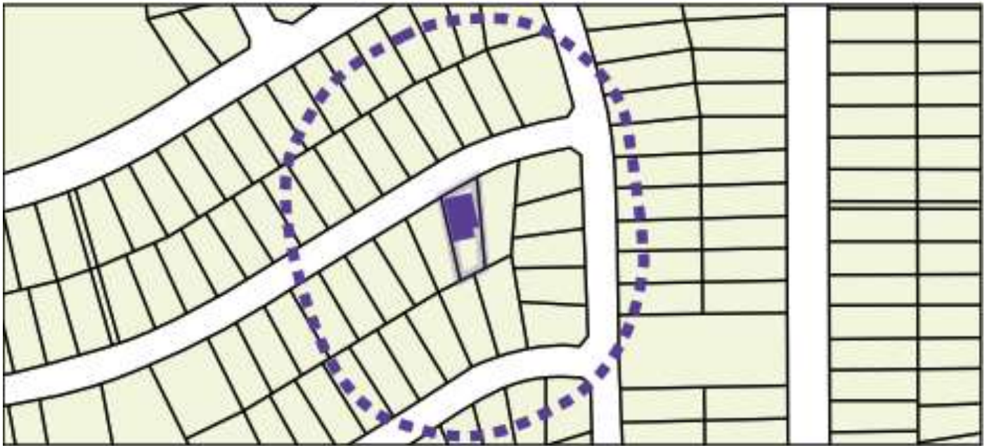
Figure 4 – 75m extent around the boundary of the site.

Note: Notwithstanding the above, notification distances specified in this section may be extended, if in the opinion of Council, greater notification is required.