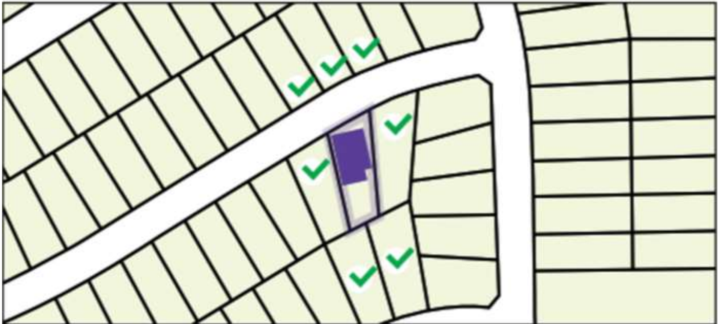
Figure 2 – Adjoining land selected around the site

Where Council specifies a distance for the extent of neighbour notification, the extent is measured from the boundary of the application site as seen in Figure 3 and Figure 4 .