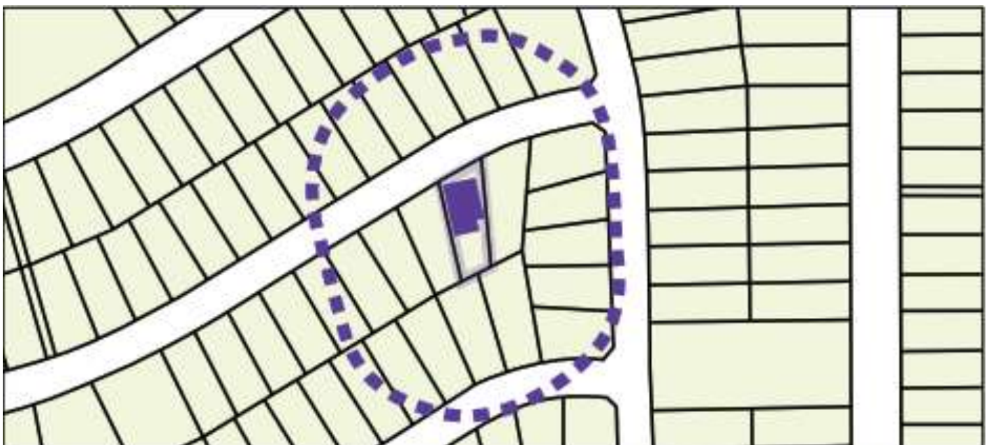
Figure 3 – 50m extent around the boundary of the site.

Where Council specifies a distance for the extent of neighbour notification, the extent is measured from the boundary of the application site as seen in Figure 3 and Figure 4 .