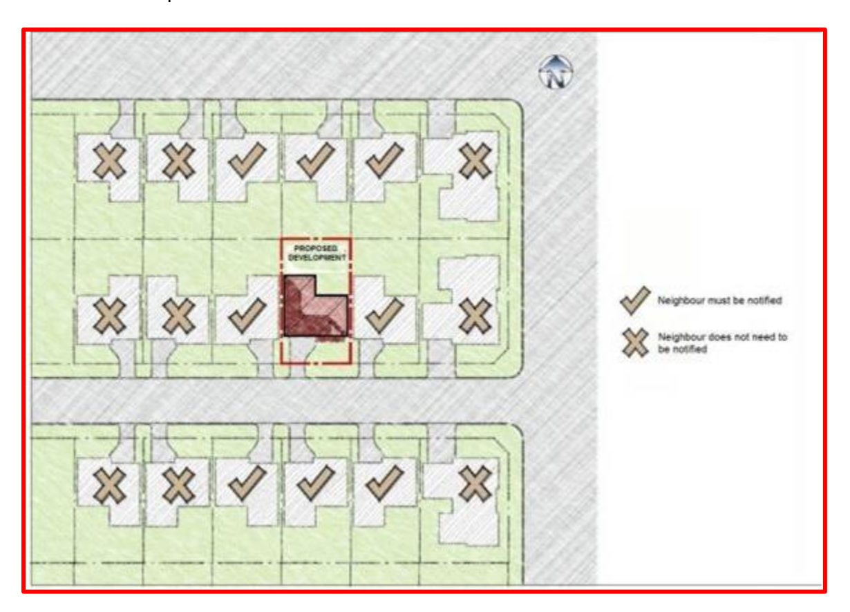
Table 2 lists the types of development applications that will be notified to adjacent and adjoining landowners or to properties within the specified distance by mail. Figure 1 outlines how adjoining and adjacent properties will be notified. Notification distances specified in this section may be extended, if in the opinion of Council, greater notification is required.