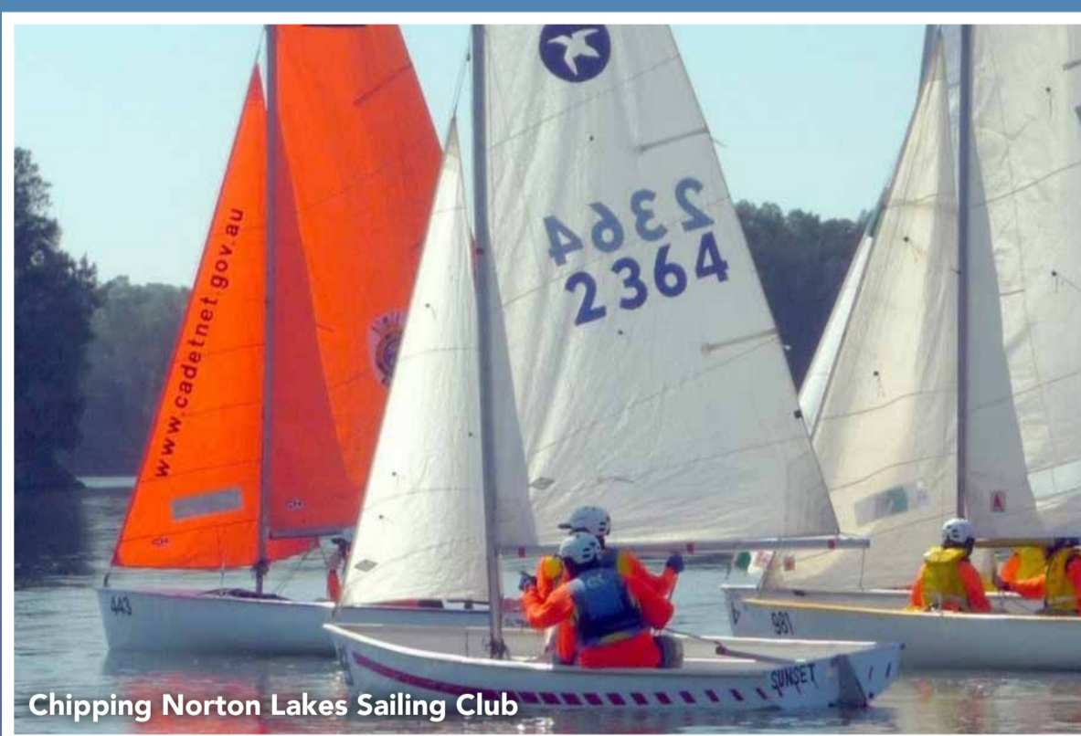
Chipping Norton Lakes Sailing Club