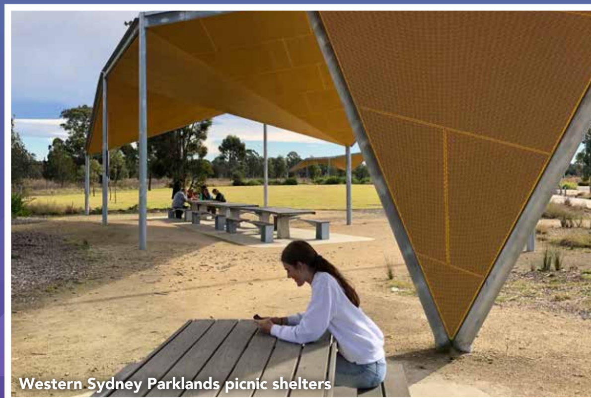
Western Sydney Parklands picnic shelters