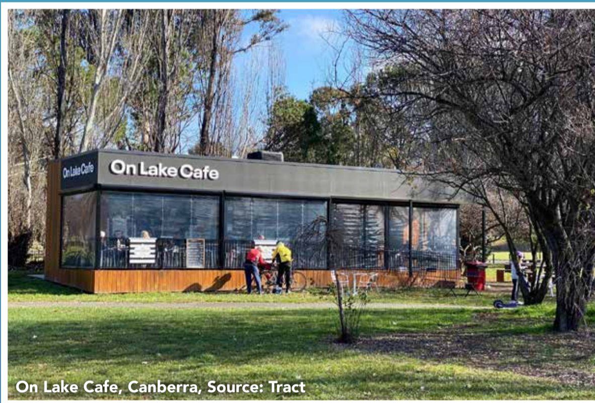
On Lake Cafe, Canberra, Source: Tract