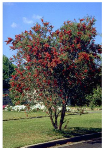
Callistemon viminalis Weeping Bottlebrush