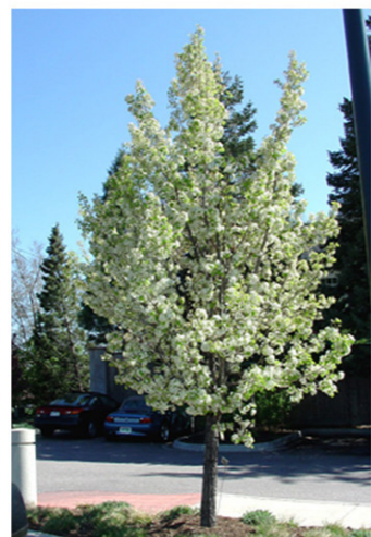
Pyrus calleryana 'Chanticleer' Chanticleer Ornamental Pear