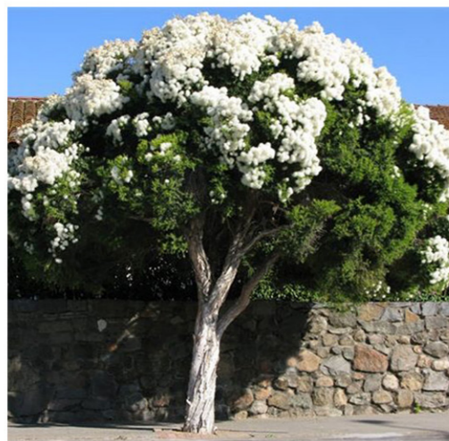
Melaleuca linarifolia Snow-in-summer Paperbark