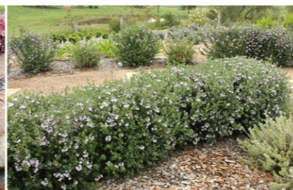
Westrigia fruticosa Coastal Rosemary