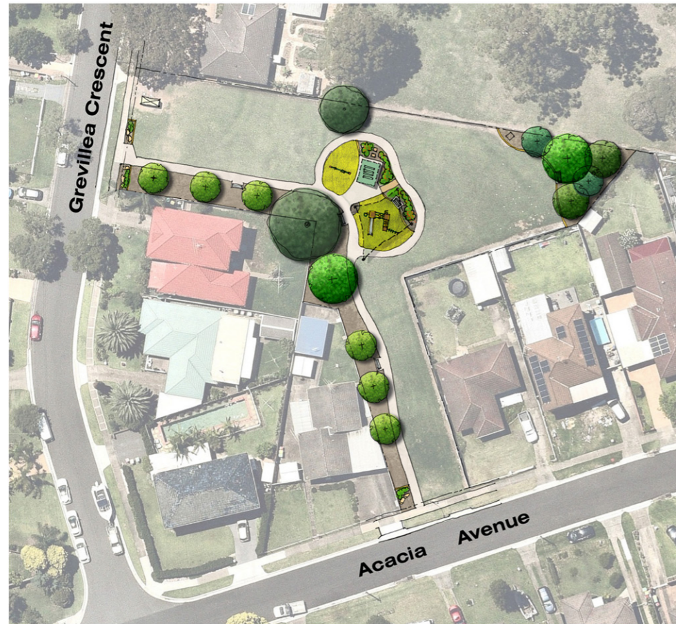
Overall layout design for Acacia Park.