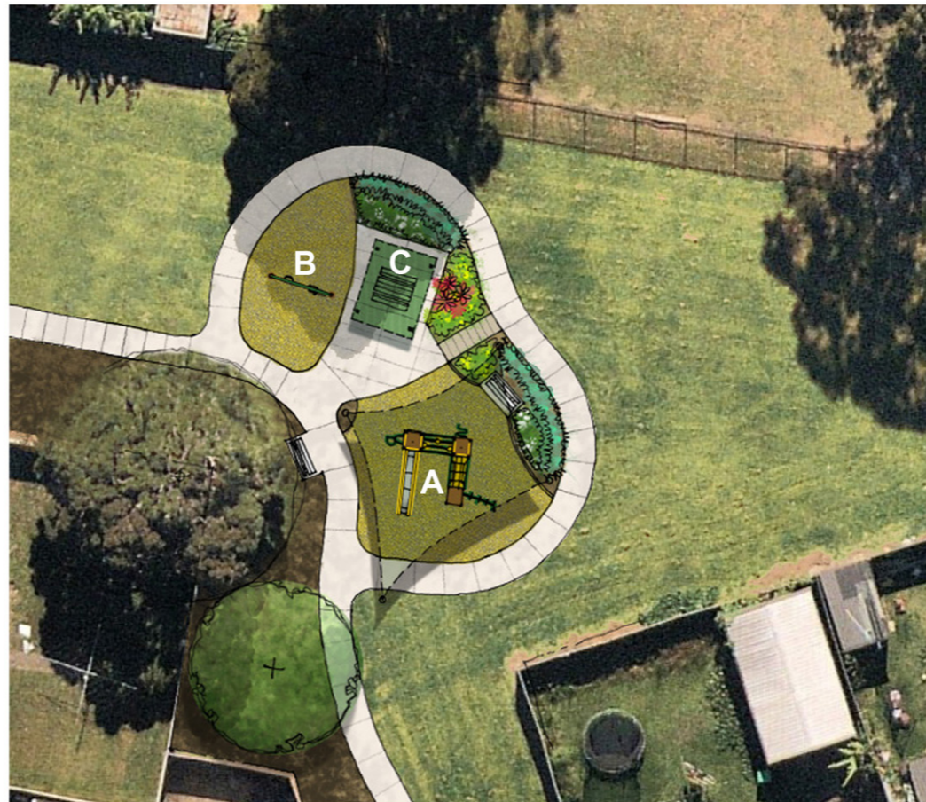
Proposed layout of the play space area.

The proposed landscape design for Acacia Park in Prestons creates a new play space with a picnic setting, seating and shelter for the local community to rest and play, while providing a new pathway to formalise a direct connection between Acacia Avenue and Grevillea Crescent.