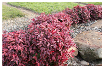
Nandina domestica Dwarf Sacred Bamboo