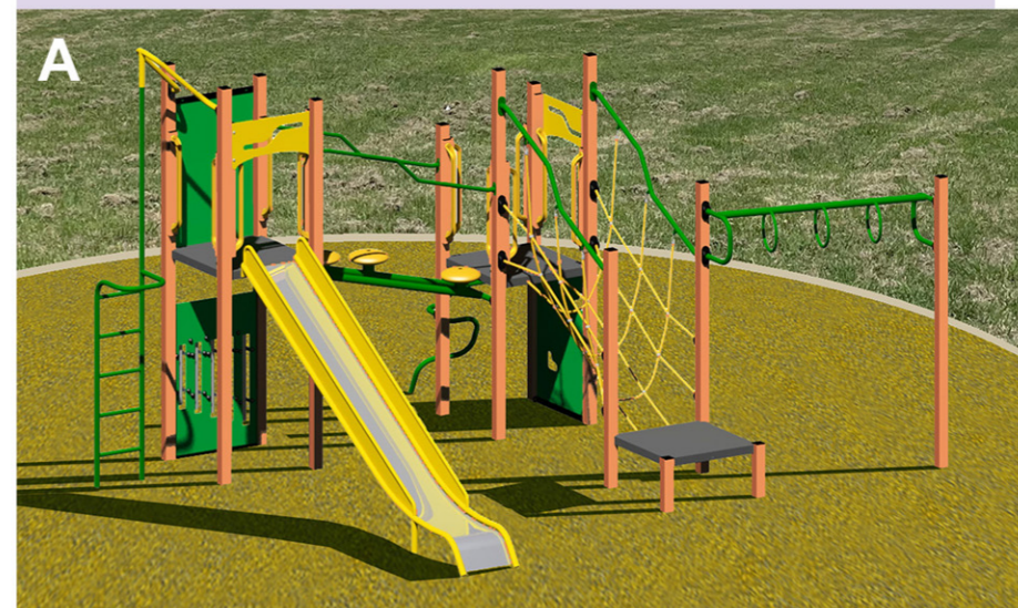
Proposed multiplay unit with slippery dip, overhead climbing rings, xylophone and climbing net

A shade sail structure will be installed over the multiplay unit to protect children from direct harsh sunlight exposure. The additional tree planting and garden beds improves the visual amenity of the park.