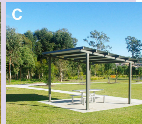
Picnic shelter including picnic setting