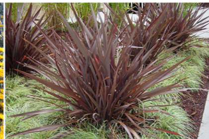
Phormium tenax New Zealand Flex