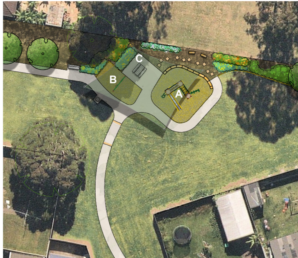
Proposed layout of the play space area.

The proposed landscape design for Acacia Park in Prestons creates a new play space with a picnic setting under shade for the local community to rest and play, while providing a new pathway to formalise a direct connection between Acacia Avenue and Grevillea Crescent.