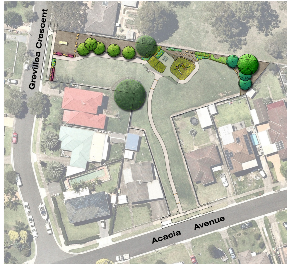
Overall layout design for Acacia Park.