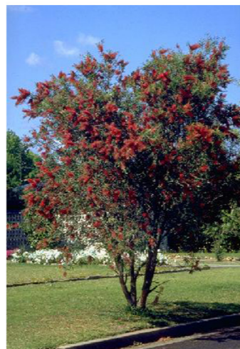
Callistemon viminalis Weeping Bottlebrush