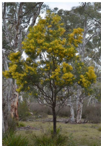
Acacia decurrens Sydney Green Wattle