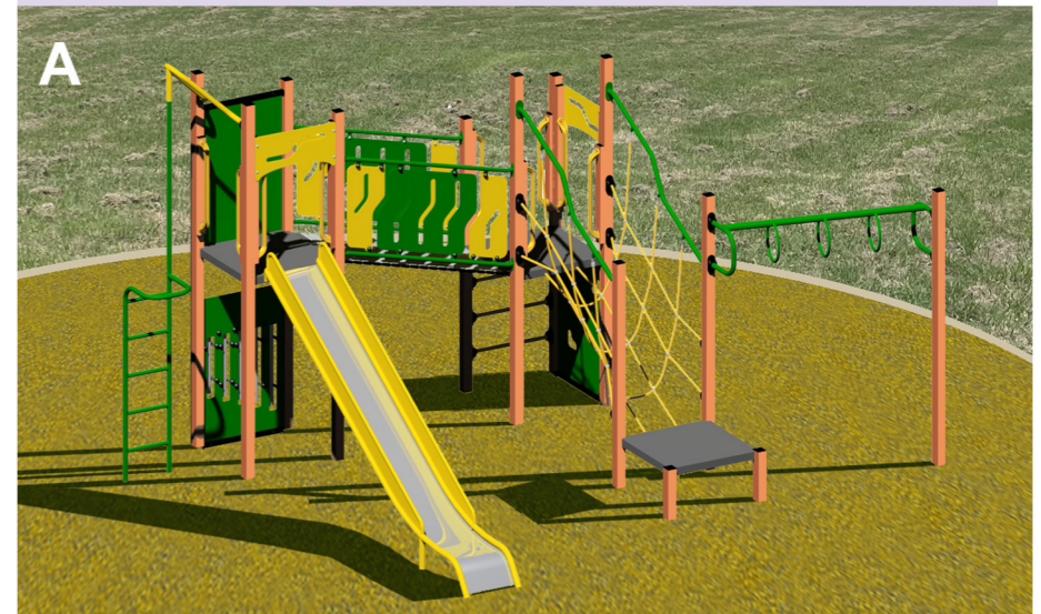
Proposed multiplay unit with slippery dip, overhead climbing rings, xylophone and climbing net