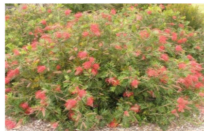
Grevillea 'Robyn Gordon' Grevillea 'Robyn Gordon'