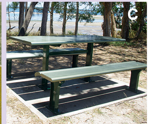
Proposed picnic setting under shade