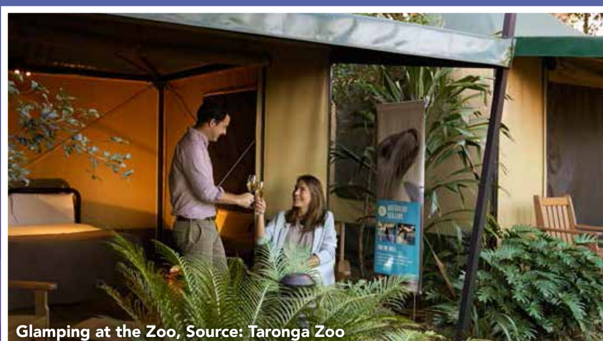
Glamping at the Zoo