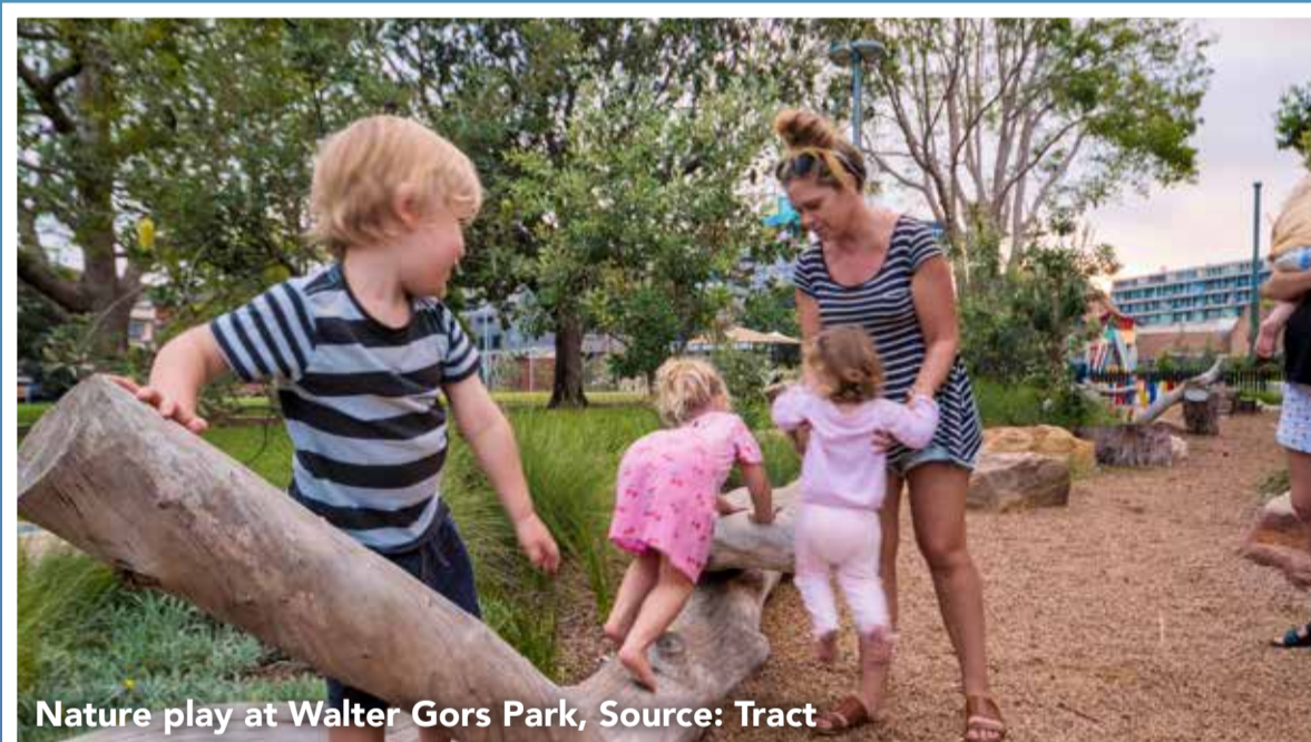
Nature play at Walter Gors Park