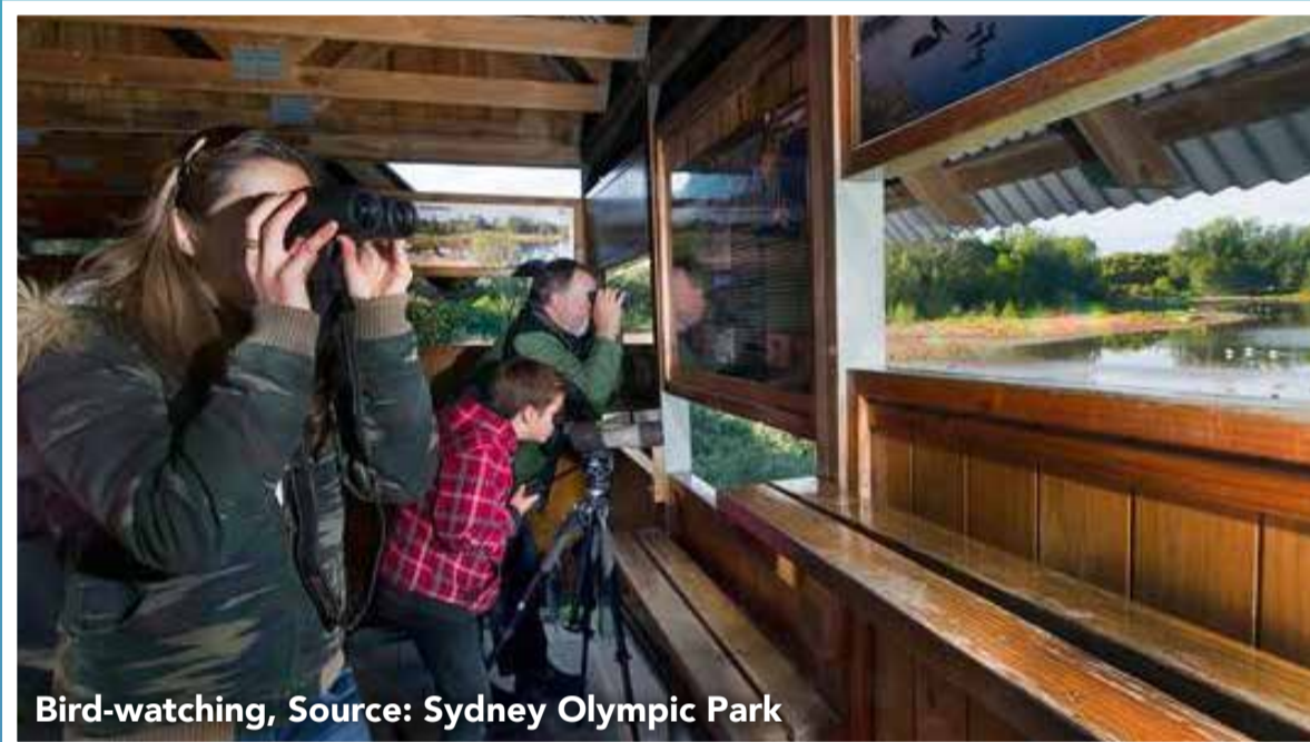
Bird-watching, Source: Sydney Olympic Park