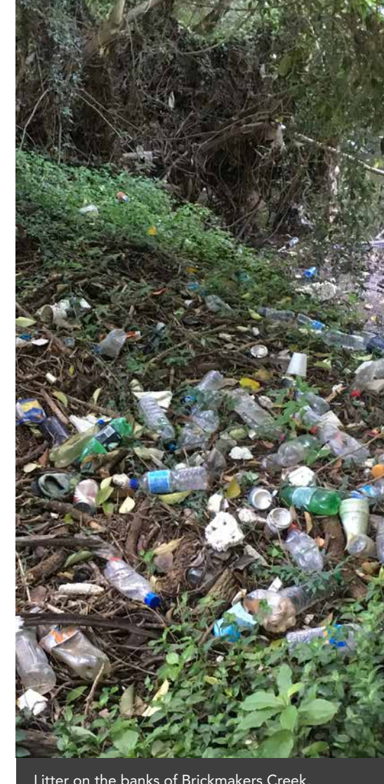
Litter on the banks of Brickmakers Creek, Warwick Farm

For more information, please visit www.liverpool.nsw.gov.au/environment/water-and-waterways/water-quality