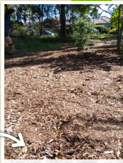
The site is clear of weeds six months later

In 2020, Council's Bush Regeneration Team trialled sugar treatment to control Farmer's Friend ( Bidens pilosa ) - a fast-growing weed. The aim of the trial was to test the effectiveness of sugar treatment on herbaceous weeds and reduce reliance on herbicide and labour-intensive techniques.