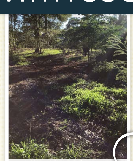
Site covered in weeds before the sugar trial