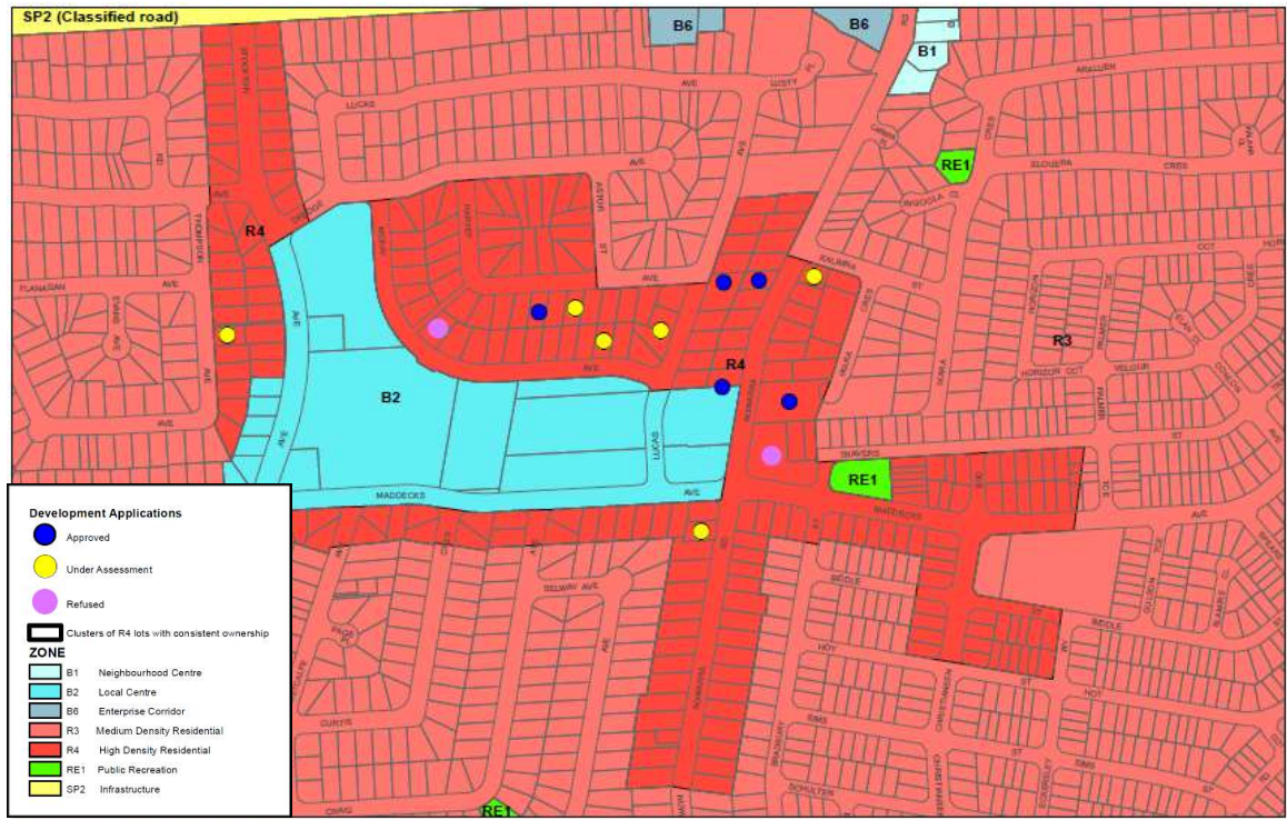
Figure 2: DAs for Residential Flat Buildings in Moorebank (August 2019)

It is noted that DPIE may stipulate certain conditions at the Gateway determination or finalisation stages. These conditions may allow for additional time for development applications for Residential Flat Buildings to be submitted prior to an amendment being made.