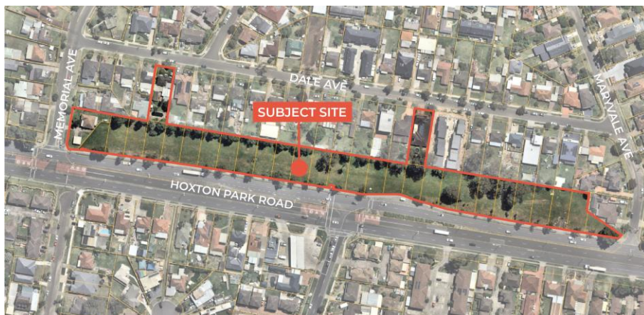
Figure 1: Land to which this agreement applies