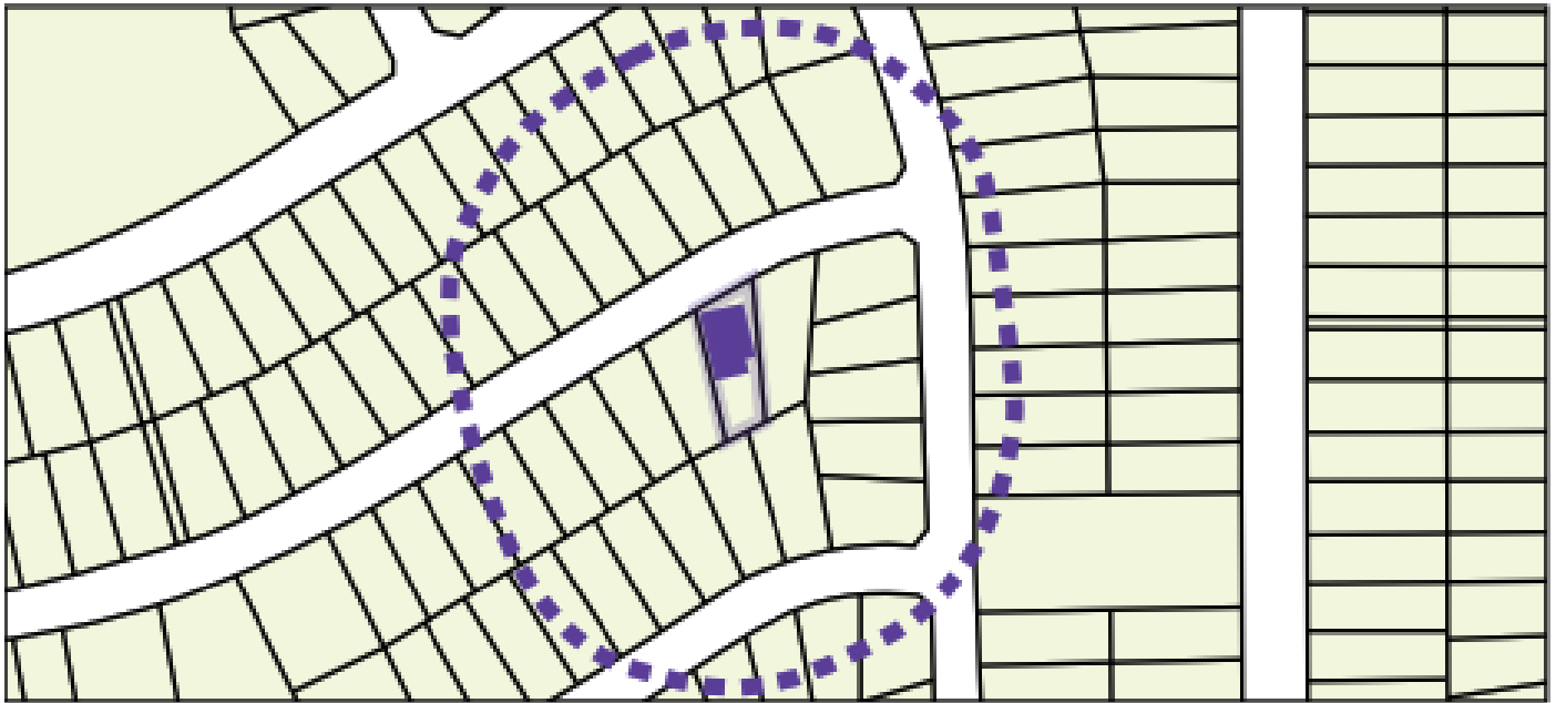
Figure 4 – 75m extent around the boundary of the site.

Note: Notwithstanding the above, notification distances specified in this section may be extended, if in the opinion of Council, greater notification is required.