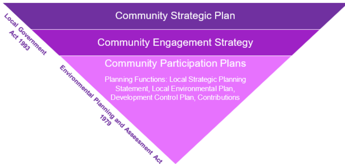
Figure 1 – Relationships between Strategic Documents

The diagram below explains the relationship between the CPP and other supporting documents and policies: