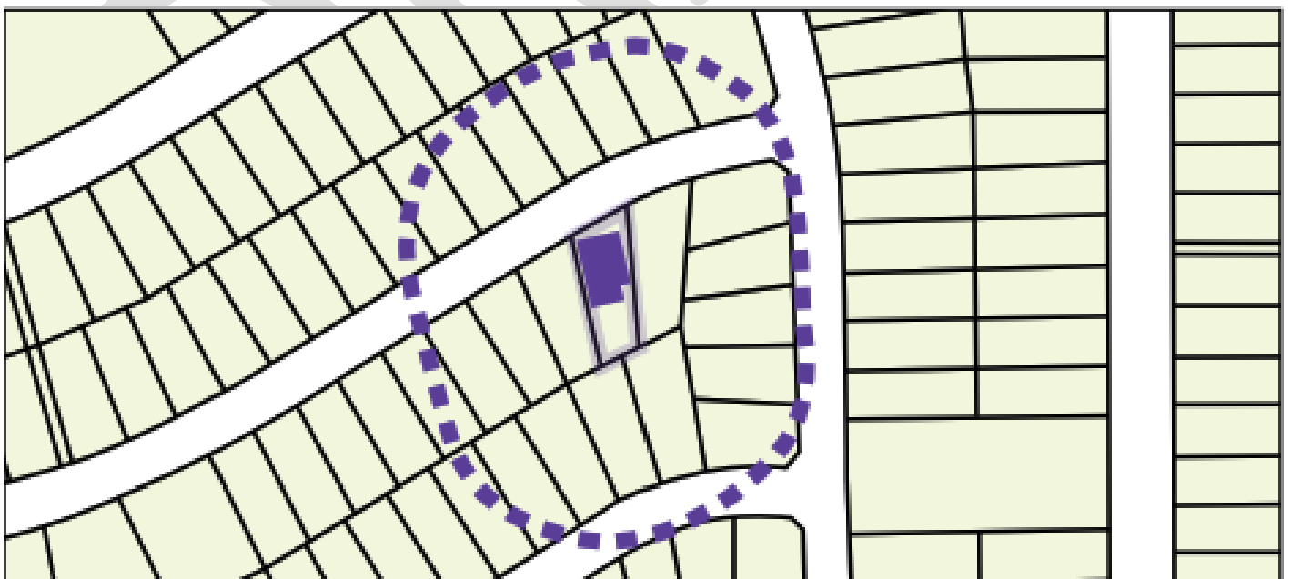
Figure 3 – 50m extent around the boundary of the site.

Where Council specifies a distance for the extent of neighbour notification, the extent is measured from the boundary of the application site as seen in Figure 3 and Figure 4 .