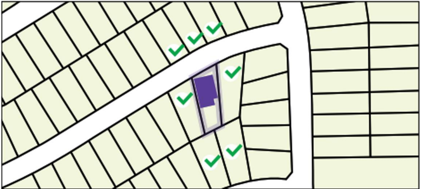
Figure 2 – Adjoining land selected around the site

Where Council specifies a distance for the extent of neighbour notification, the extent is measured from the boundary of the application site as seen in Figure 3 and Figure 4 .