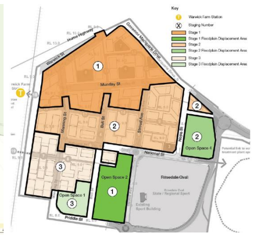
Figure 1 - Indicative Staging Plan.